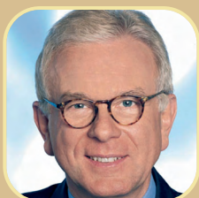
European Parliament President Hans-Gert Pöttering

European Parliament Chamber, Paul-Henri Spaak Building, Rue Wiertz, 1047 Brussels