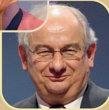
CoR President Delebarre

8 October 19:00 - 21:00 Official opening of Investors' Café